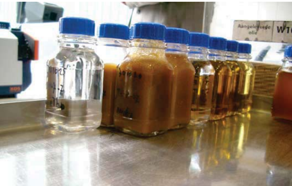
Sunoil Biodiesel currently produces 80 million litres of biodiesel per year